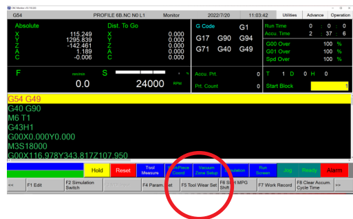
Screen Picture 2

At monitor screen choose F5 Tool Wear Set (screen 2 picture)