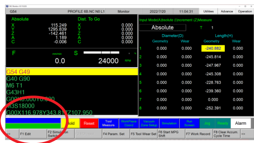
Screen Picture 3

You can select a range of tools to view or change using the page up / page down buttons